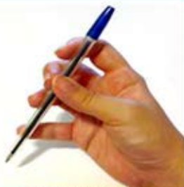
4 FINGER GRIP 3-4 years old

All fingers are holding the writing tool but the wrist is turned so that the palm is facing down towards the page. Movement now comes mostly from the elbow. Children should start being able to copy a horizontal, vertical and circular line.